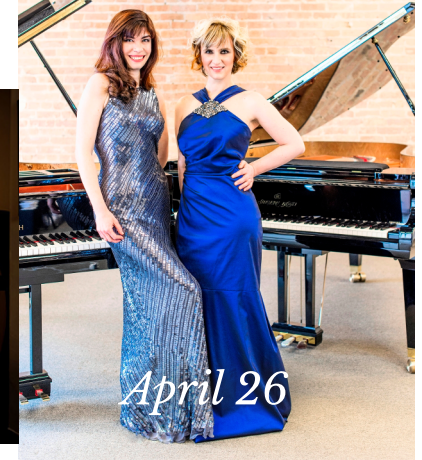
EStrella Piano Duo